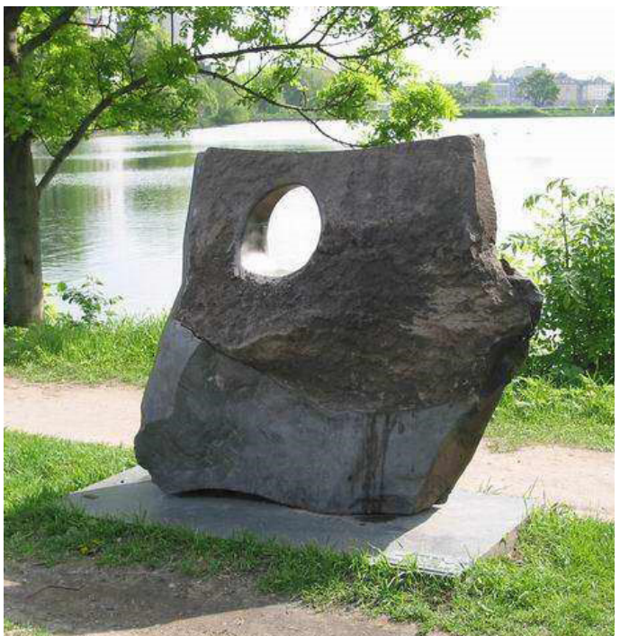
Placed at Sankt Jørgens Sø/ Gyldenløvesgade